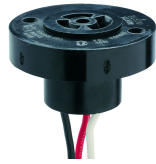
K121 ANSI C136.10 Locking Type NEMA Receptacle, (9" lead), gasket included